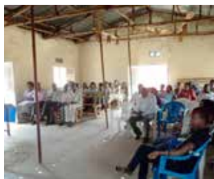
These people need help to open their church