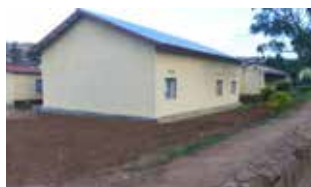
A wonderful church building closed because of no paved parking