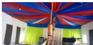
The beautiful church interior